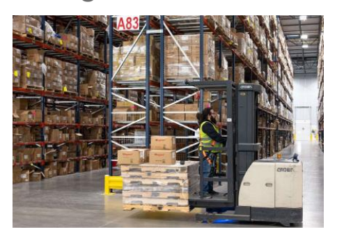
New manufacturing plant in Monterrey, Mexico

Consolidation of 5 distribution centers into a single new one in the US